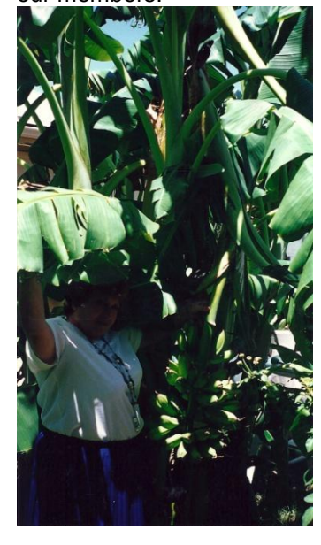
Oh, by the way, she loves growing bananas.